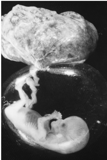
Fig. 1. Fetus.

In Fig. 1, a photograph of a nine-week old fetus's environment reveals the placenta and umbilical cord. Cushioned in amniotic fluid,