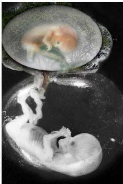
Fig. 3. Cosmic Egg. Used by permission of Omikron/Photo Researchers, Inc. and Photoshop artist Eric Lennstrom.

multiplicity” (Jung, CW 5: 589). The Polynesian islanders of Anaa believe that “the universe was like an egg which contains Te Tumu [The Foundation – male] and Te Papa [The Stratum Rock - female]” (Campbell, The Hero with a Thousand Faces 274). The cosmic egg is emblematic. It is the embodiment of life essence and a relief from the bewilderment of corporal existence seeking spiritual manifestation. It is perhaps an answer to the state of chaos which the Greeks named cosmos, regarding it as a clearing up of the external world. For the classical soul, cosmos is “a harmonic order which includes each separate thing as a well-defined, comprehensible, and present entity” (Spengler 63). In the Egyptian cosmogonic Coffin Text , the “first form of God was as a spirit, alone and held in solution in the waters. Then, but still in the waters, God was a