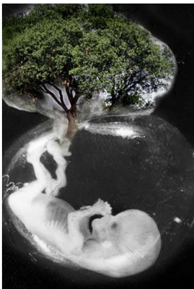
Fig. 2. World Tree. Used by permission of Omikron/Photo Researchers, Inc. and Photoshop artist Eric Lennstrom.

breather with their earliest sense-memory as a fetus, as it did for me.