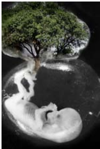
Fig. 3. Cosmic Egg.

Used by permission of Omikron/Photo Researchers, Inc. and Photoshop artist: Eric Lennstrom